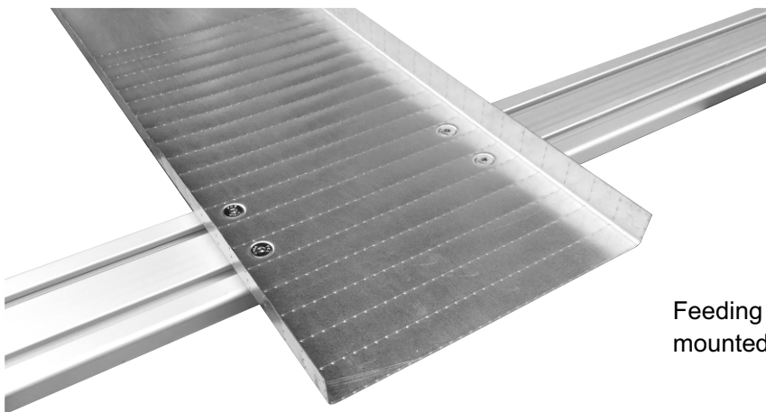
Feeding Tray and aluminum bar with mounted Tray Fastener T-Slot from above